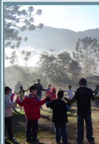
Dances with Youth in Brazil