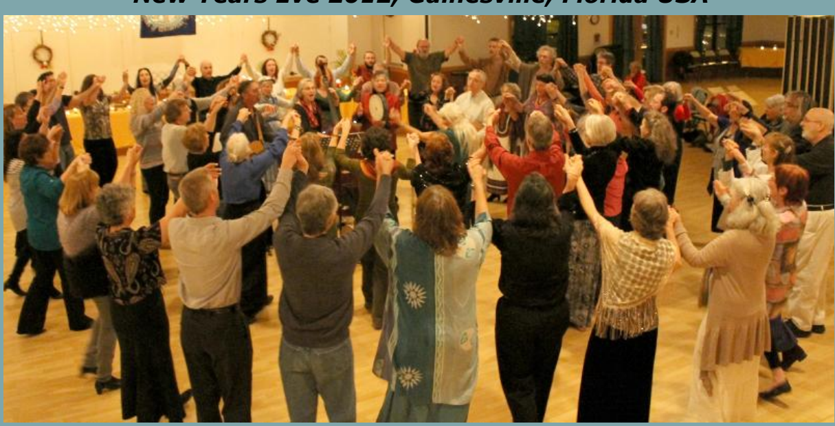
New Years Eve 2012, Gainesville, Florida USA

should contact Gisele to confirm the meeting place and time of the next dance meeting: <u>gisele_la@mac.com.</u>